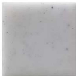
PLUTON D-119 Sand Salt