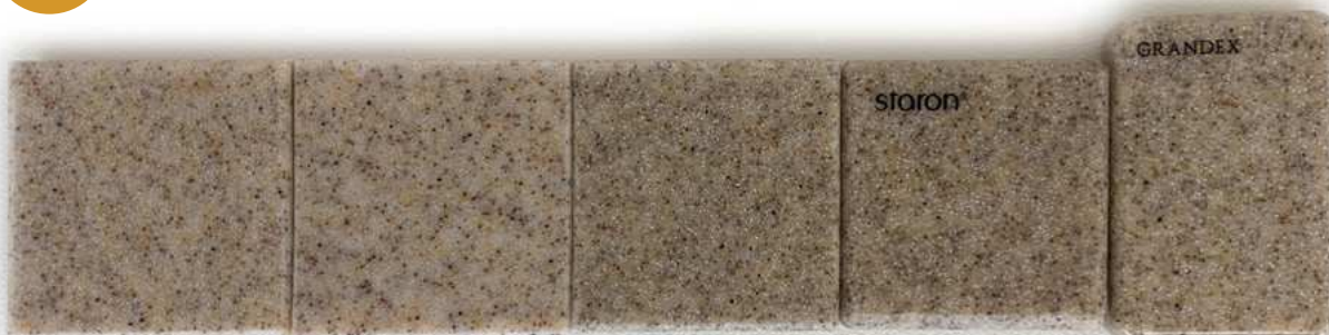
PLUTON D-009 Sand Bank