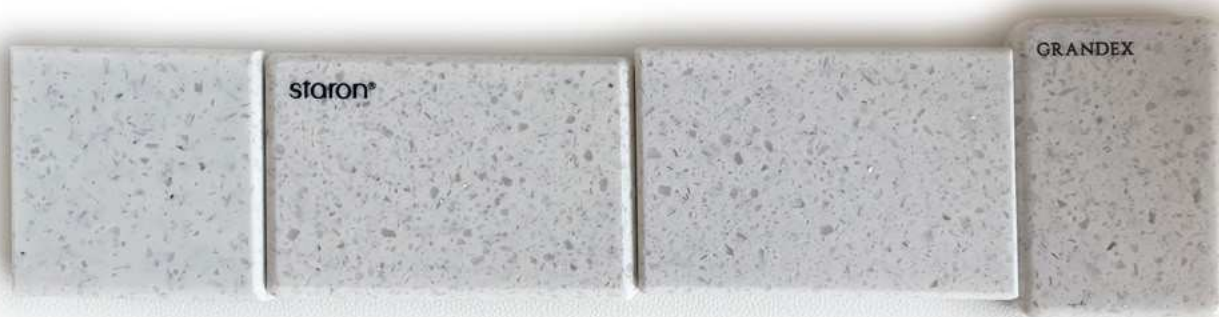
PLUTON T-110 Moon Galaxy