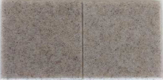
PLUTON D-012 Light brown