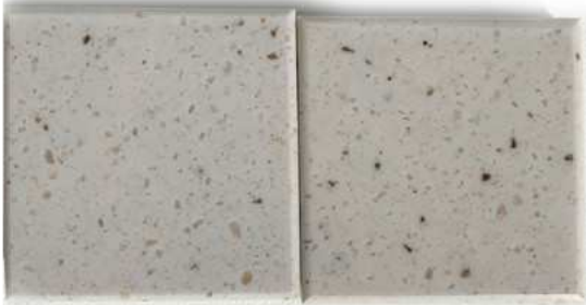
PLUTON T-068 Rice Cookie