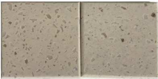
PLUTON T-098 Cold Stone