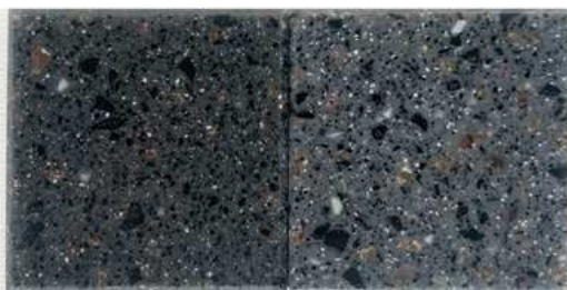
PLUTON T-119 Sun Onyx