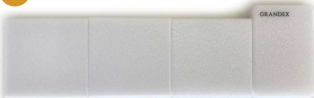
PLUTON D-024 Silver White