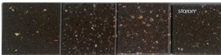
PLUTON T-109 Sun Coffee