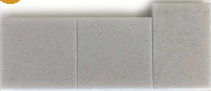
PLUTON D-101 Nantucket