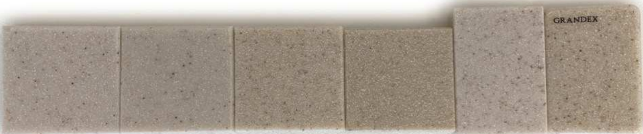
PLUTON D-102 Sea Shore