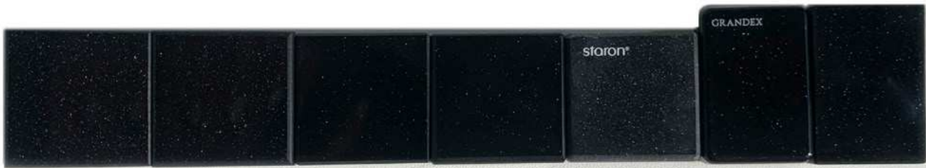
PLUTON P-005 Night Gleam