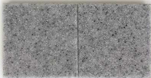
PLUTON D-007 Mist