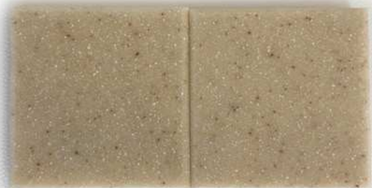
PLUTON D-003 Gold Brown