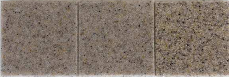
PLUTON D-039 Navajo