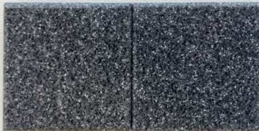
PLUTON D-013 Night Light