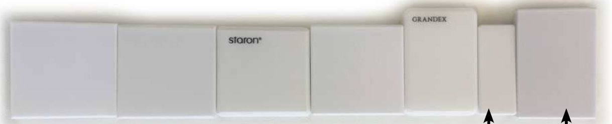
PLUTON S-008 N-White