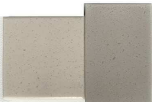
PLUTON D-121 Sand Lily