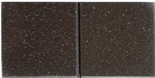
PLUTON P-007 Brown Eyes