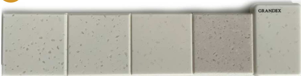
PLUTON C-001 Cubic White