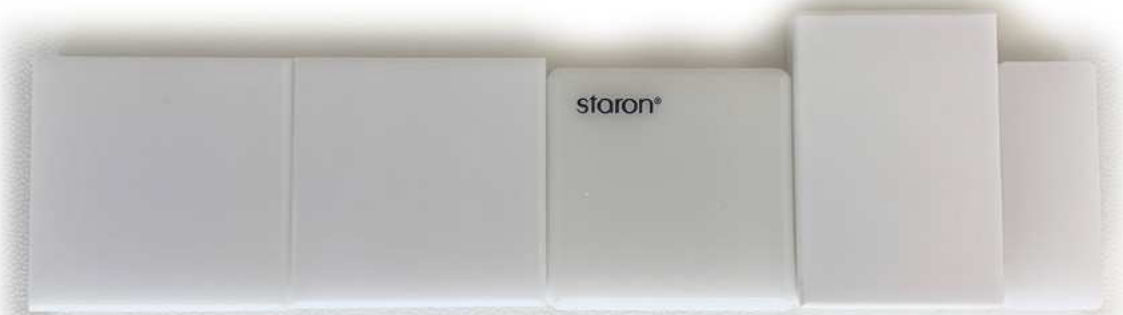
PLUTON S-001 R-White