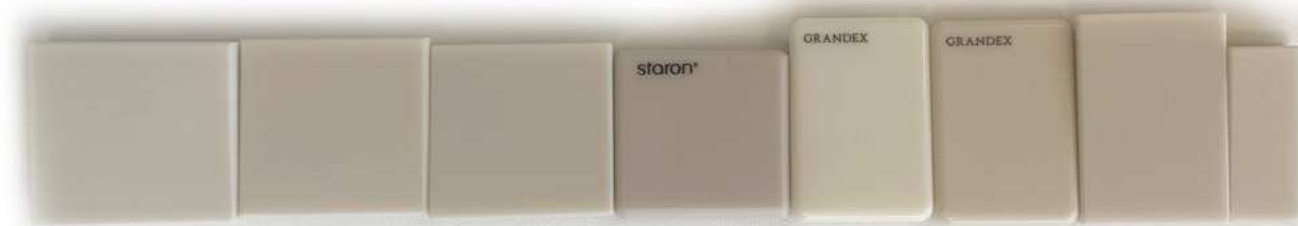
PLUTON S-004 Ivory